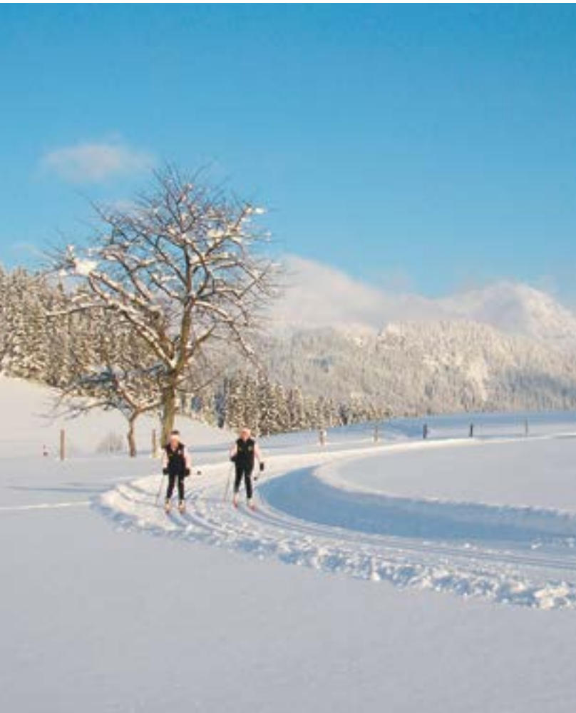
The cross-country ski trails traverse one of the most scenic high plateaus in Lower Austria.

Lower Austria's most snow-reliable skiing area offers the possibility to enjoy the fascination of freeriding. The “Freeride Zentrum Ost” allows an ideal approach to skiing in the open country, based on its high alpine and compact location. It offers both gentle slopes for young and elderly people and challenging runs for experts.