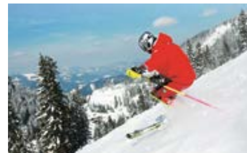
Winter with flair: Enchanting snow-covered landscapes, fast runs and wonderful Alpine vistas.