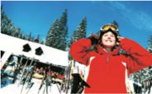
What would a day of skiing be without stopping at a ski hut? A little rest and fortification, a little sun and you are all set to hit the slopes again. What a great feeling!

Hochkar is famous for more than its great runs. The snow-covered countryside is so enchanting, dotted with iced bushes sparkling and bent to the wind. The open vistas are so impressive. One of the best outlook points is the Geischlägerhaus on the 1770 meter (5807 foot) high Hochkar Vorgipfel. The view from there extends over the Central Alps and Alpine Foothills to the Bohemian Forest. The cozy ski huts and inns are welcoming places for a break. Most of them also have sunning terraces. The two après ski bars are cheery spots to get together after a day on the slopes.