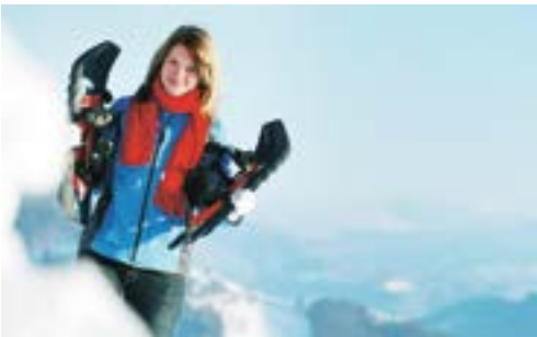
Winter adventure during guided snowshoe tours

Tip: The floodlight circle at the „Ablass-Hof“ has a length of two kilometres, is groomed for classic cross-country skiers and skaters and daily illuminated upon prior notice.